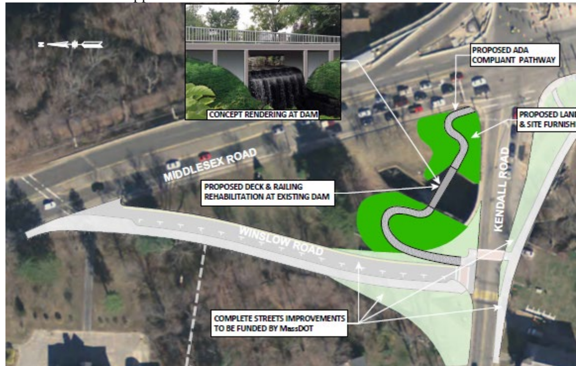
Proposed Phase 1 Improvements Town Common - Tyngsborough,